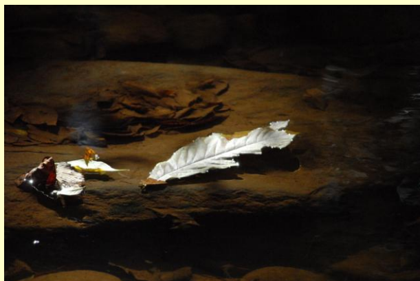
Ensemble – 1 © Leif Jensen