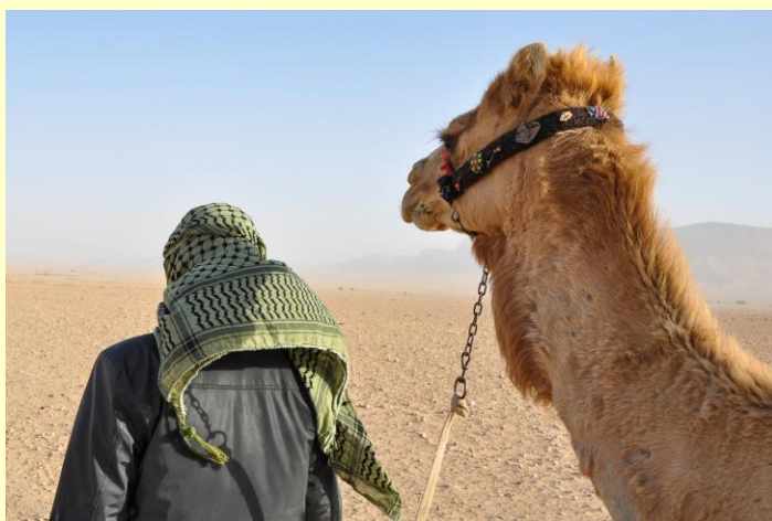
Bedouin in the Tandorean Desert Syria