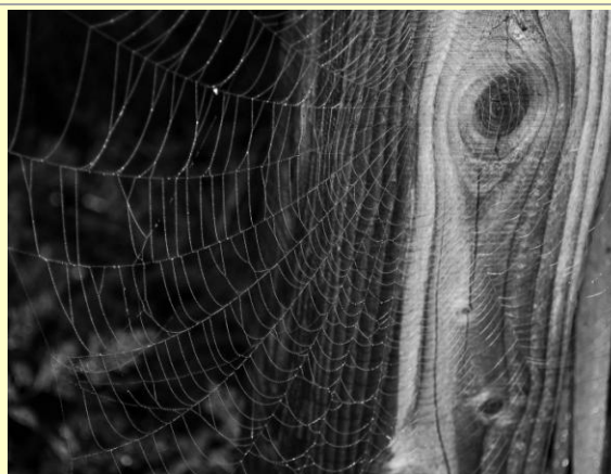
The Web © Denyse Morin