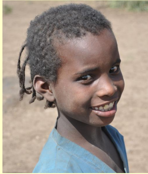
Side Profile © Manorama Rani