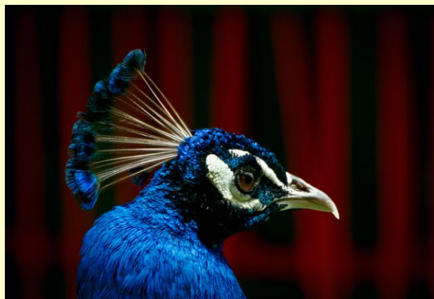
Pavo Real © Carmen Machiado