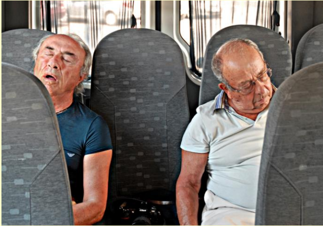
On the Road Again © Emine Gorgen