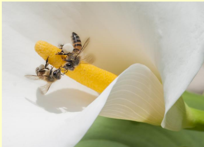
Team Work