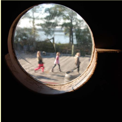
Have a Peek © Aung Win