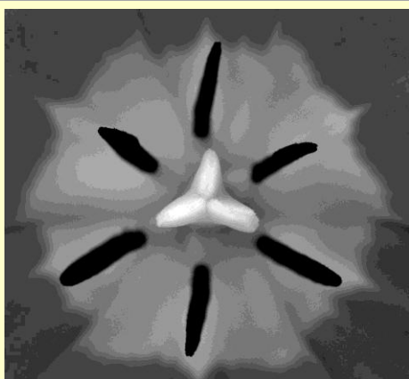
Holland Heart