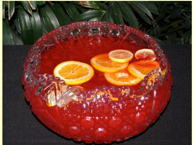
Wedding Punch