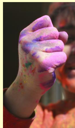
Holi Celebration