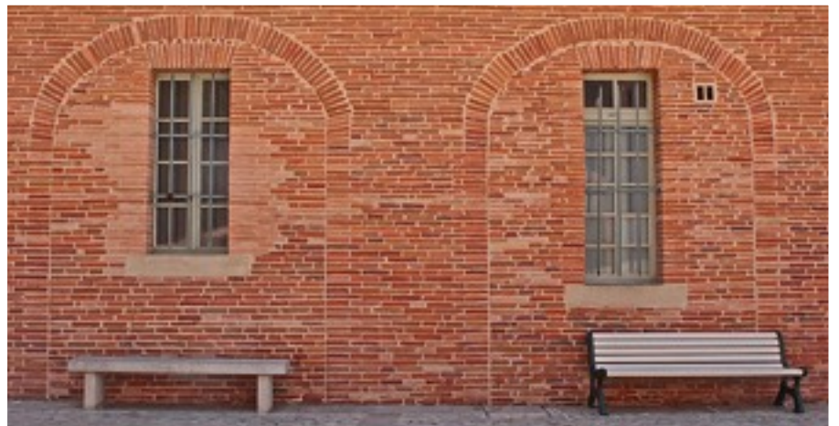
HM: Chantal Rigaud. Stone Bench vs. Wood Bench