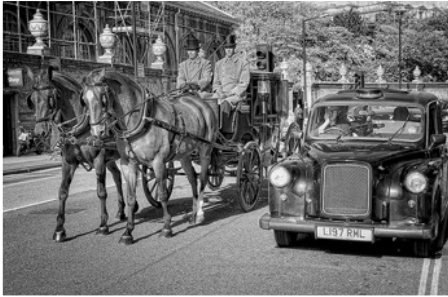
HM: Jevgenijs Bujanovs. Genesis