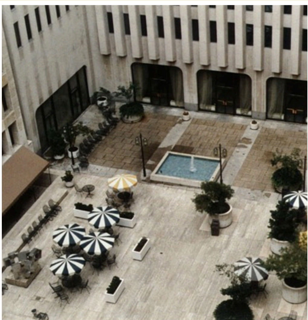
Courtyard of the Main Complex, with view to the southwest of former Buildings “D” and “E” that were later rehabilitated. The courtyard became the current atrium. (c) Bill Katzenstein

http://www.iconicphoto.com/portfolio-fp-early-world-bank.htm