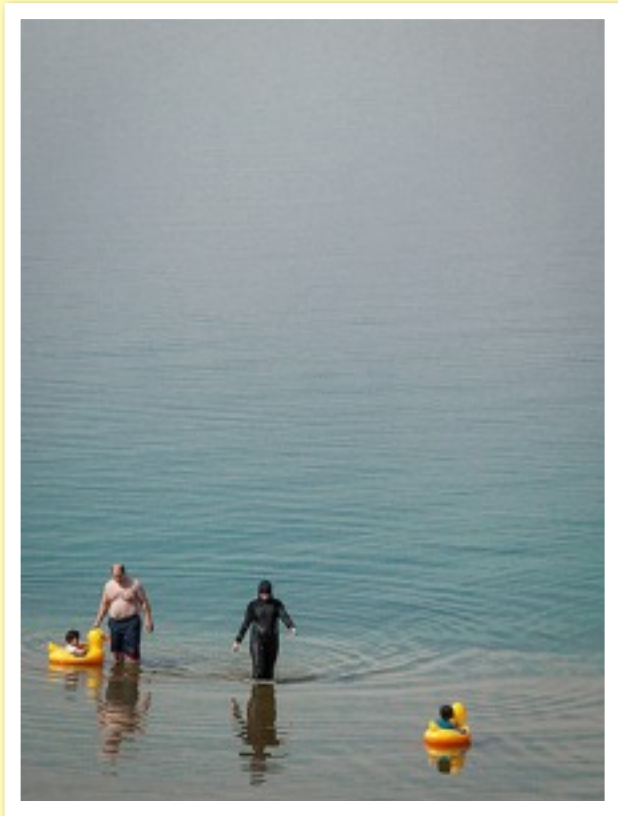
HM: Dorte Verner. The Dead Sea