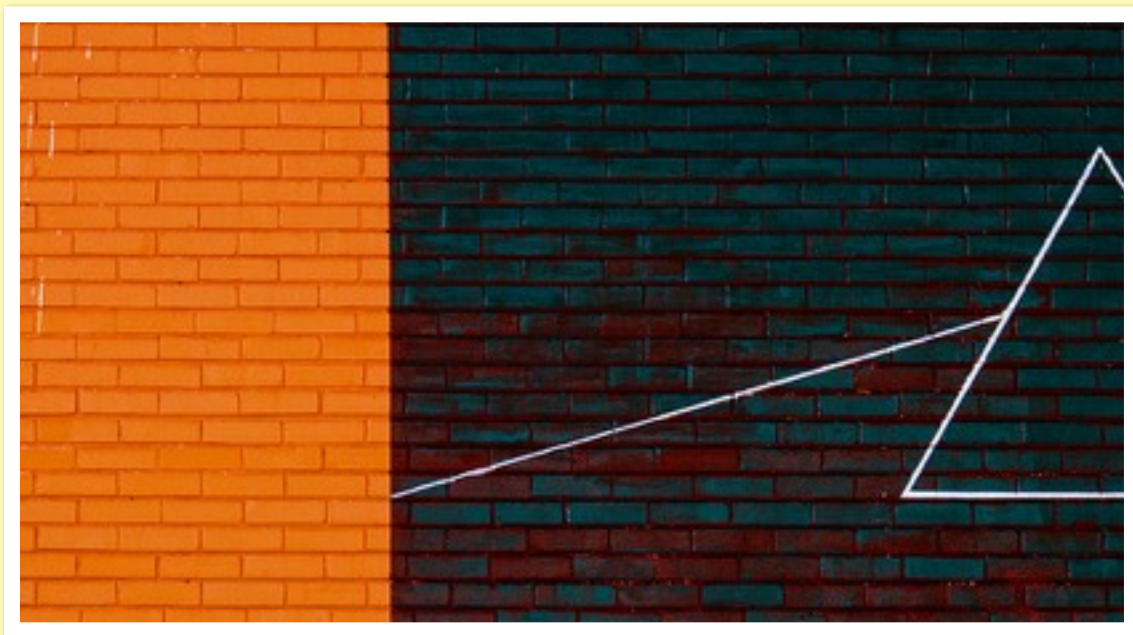
2nd Place: Jevgenijs Bujanovs. The Dark Side of the Wall