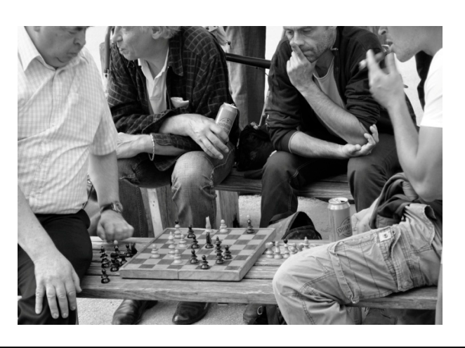
Next move bw © Denyse Morin