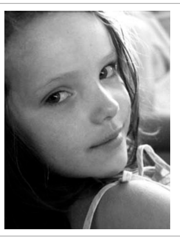
Gentle Beauty