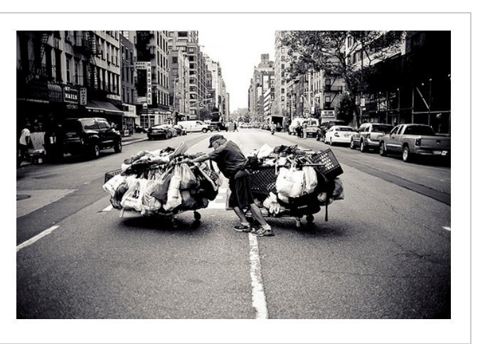
Chelsea NYC