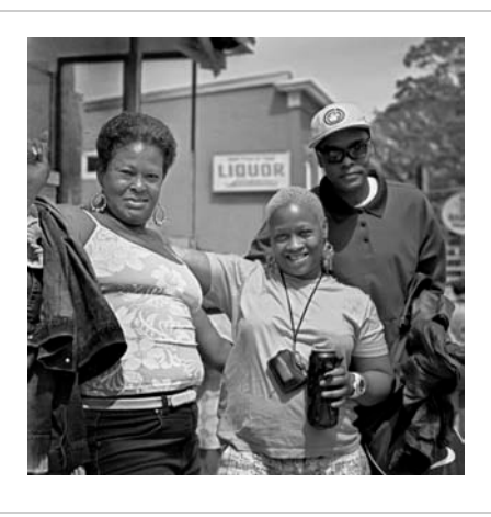
Sunday morning