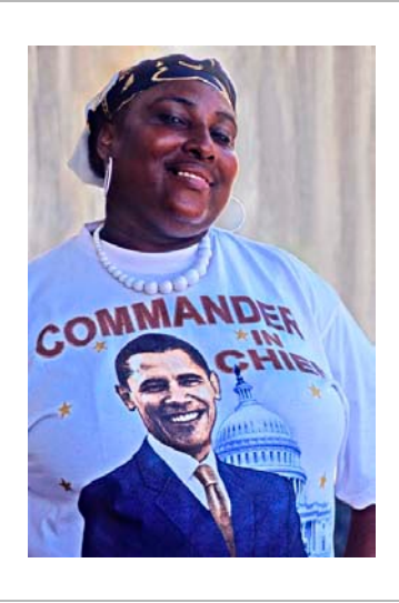
Fashion Statement © Emine Gurgen