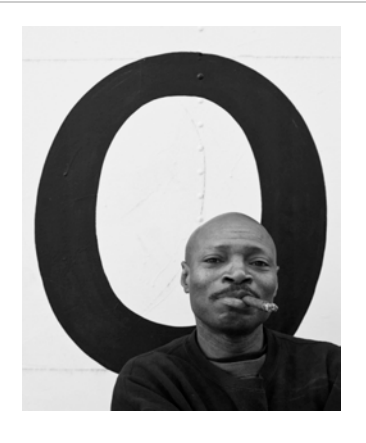
Have a smoke