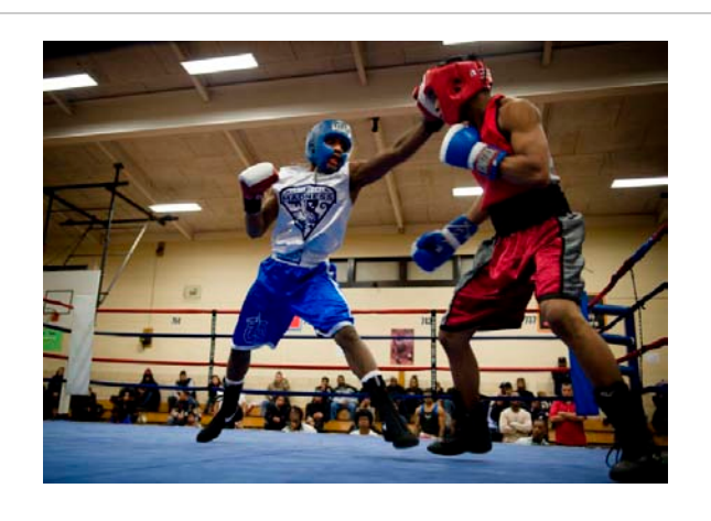
Madness © Dirk Mevis