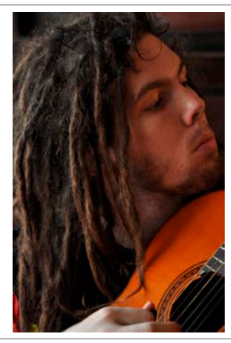
Strumming © Jack Titsworth