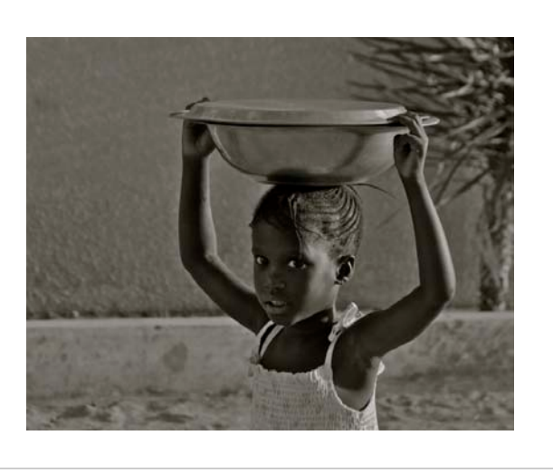
Just like mom