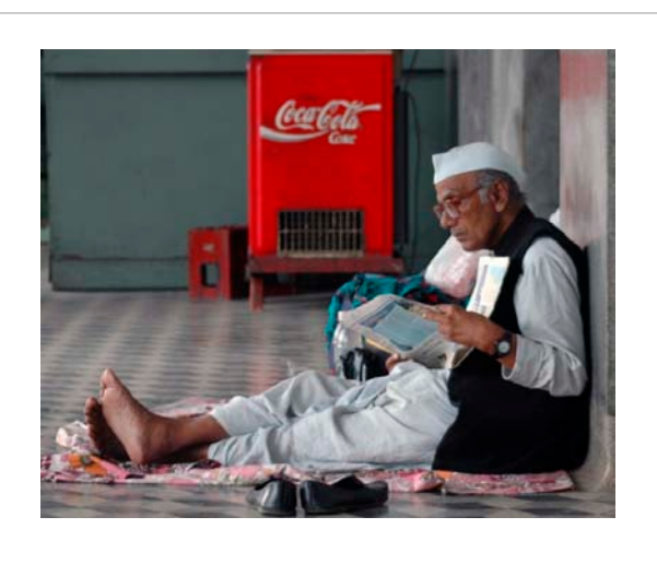
Morning news