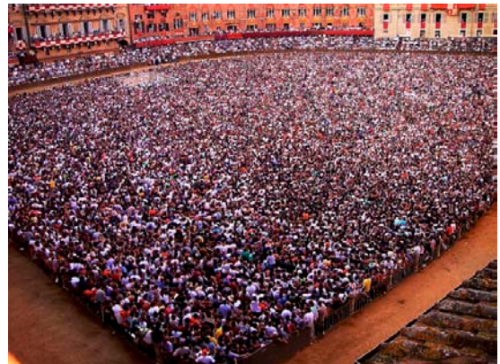
People of Palio