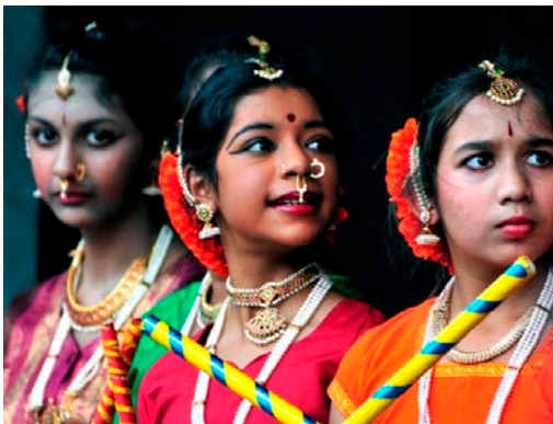
Indian Dancers © Jean Boyd