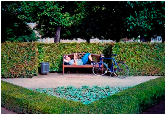
In the park 9 © Alex Hoffmaister