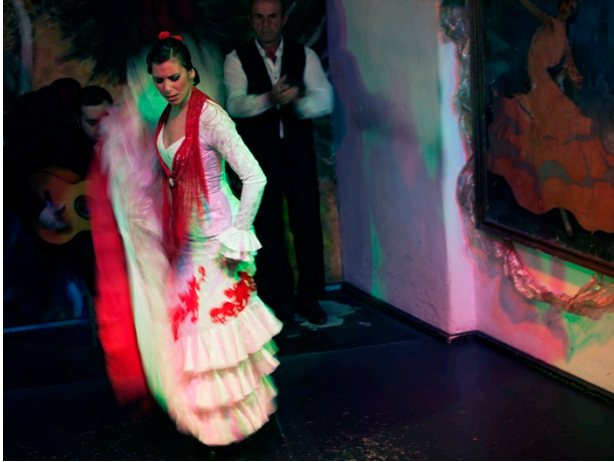
Flamenco Dancer © Yuan Xiao