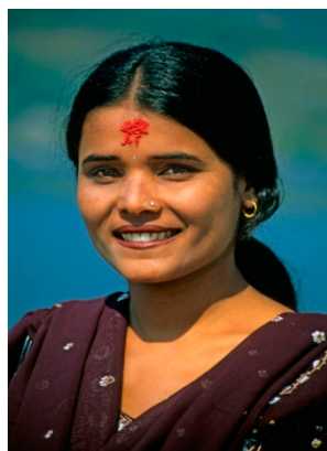
Faces of Nepal © Emine Gurgen