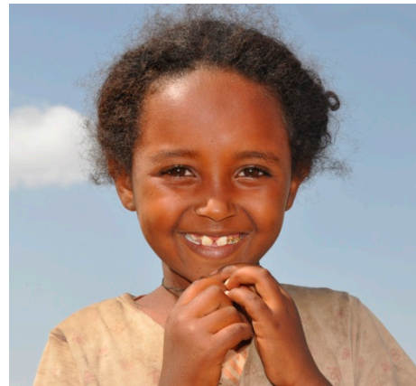
My first picture