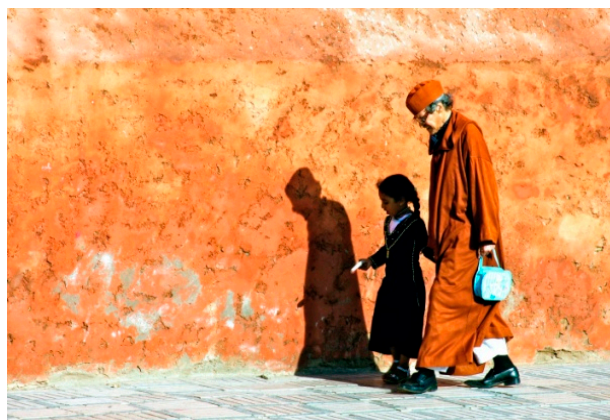
Education through generations © Kemal Cakici