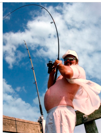
Big Stomach © Khai Nguyen