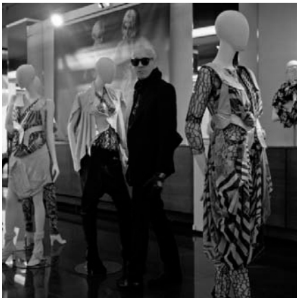
Moda © Alain Conet