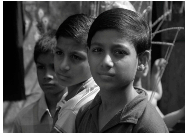
Faces of Youth