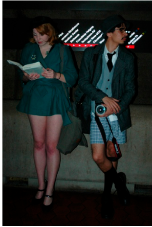
Business Casual