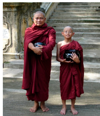
Two Monks © Aung Thurein Win