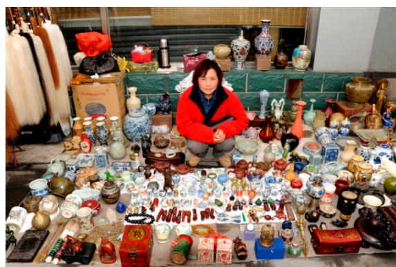
Beijing Flea Market