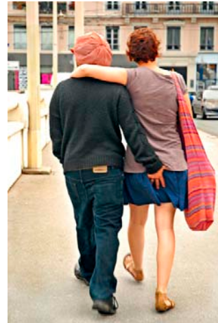
Walk-a-Grope © Emine Gurgun