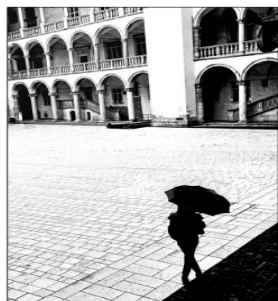
From the dark