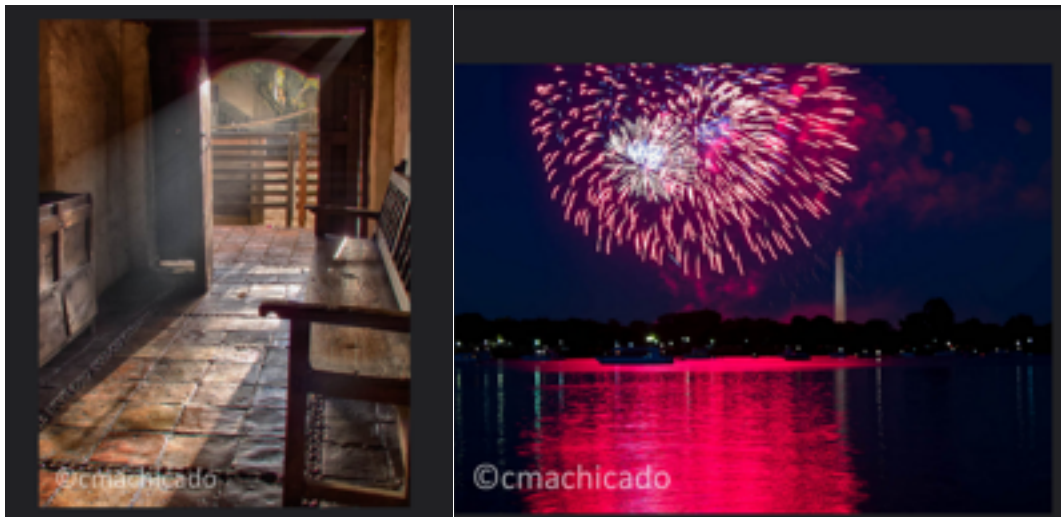
(Above left: Bogota ; right: Untitled )

The IPS has made a donation in her name to the two charities she sponsored: the ASPCA and Feed The Children.