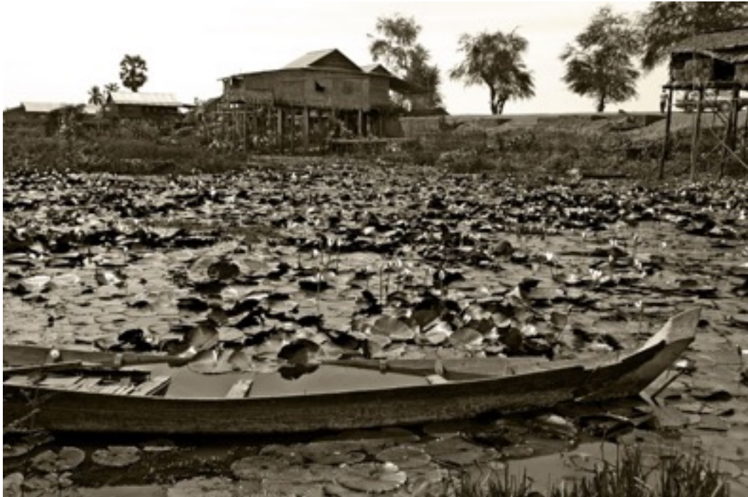
Igor Rykov, deadboat 3 rd Place