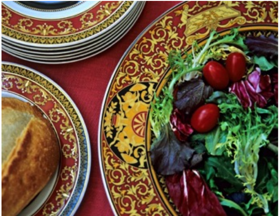
Emine Gurgen, Gourmet Start Honorable Mention