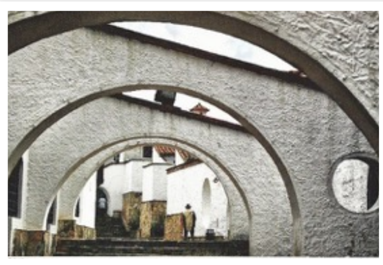
Above right: Strait of Tiquina, Bolivia / Left: Colombia (World Bank Staff Association Calendar, March and October 2016 respectively)