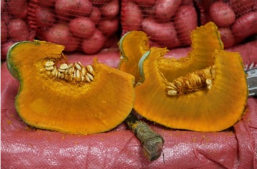
Bermet Sydygalieva, Farmer's Market 2 nd Place