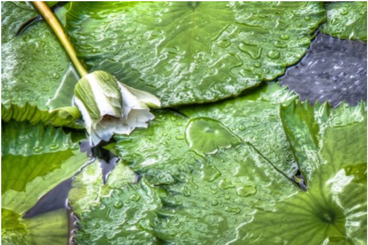
Ceyda Oner, Lilypads Honorable Mention