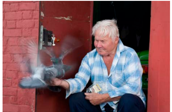
Man with Pigeons