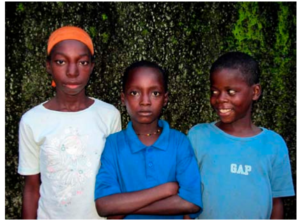
Friends