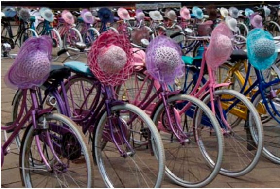
Bicycles with Hats © Sena Eken