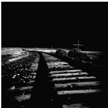
Untitled (3) © Jihad Dagher