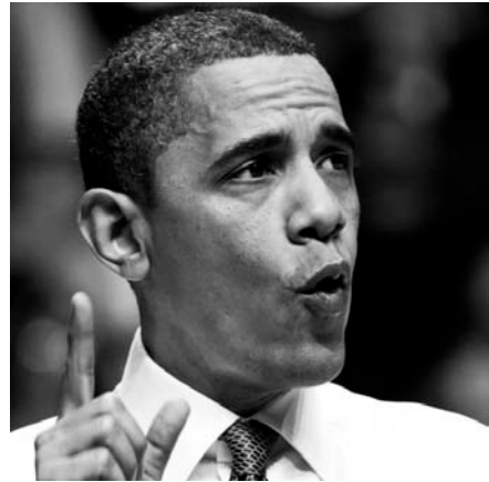
But make no mistake