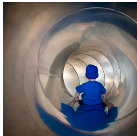
Into the Light