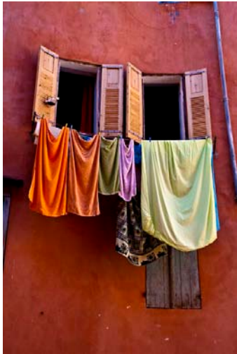
Back Alley in Grasse © Carmen Machicado