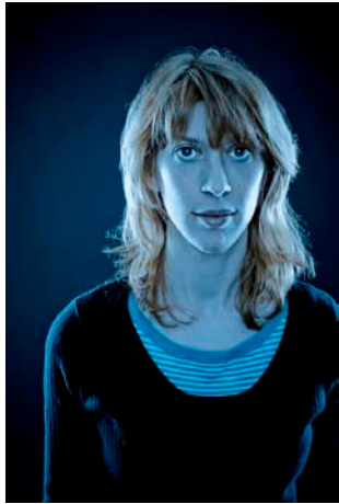
Leike Cool © Dirk Mevis