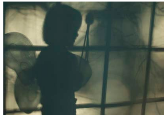
Little Fairy Visiting