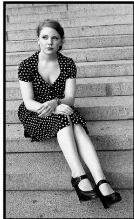
Untitled 33