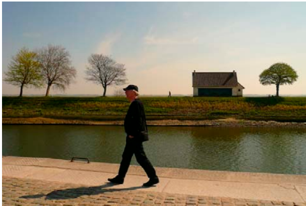
Echo © Caroline Plante