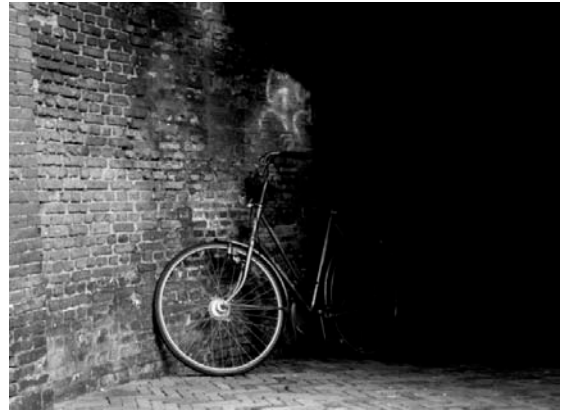
Dutch Ride