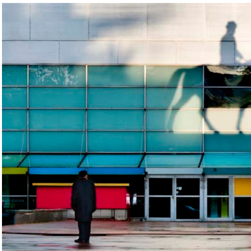
Man and Horse