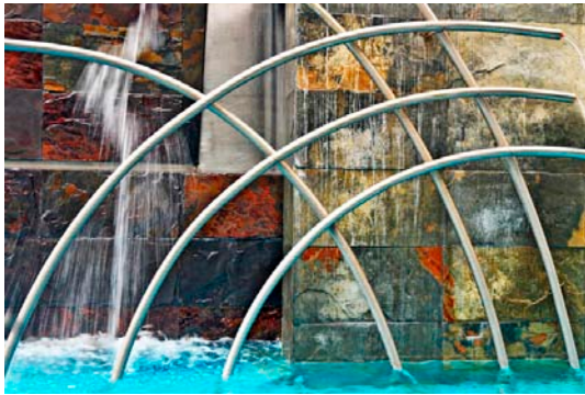
Fountainhead © Emine Gurgun