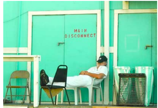
Fisherman Cove Punta Gorda