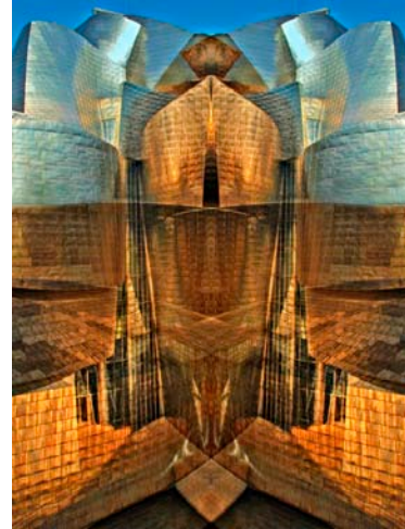
Guggenheim Interpretation 2 © Emine Gurgun