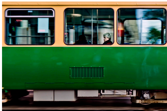
Metro Ride 2