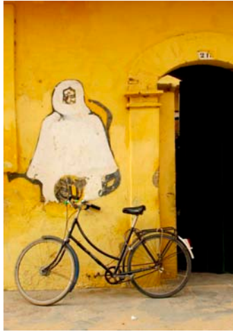
Well Guarded Bike