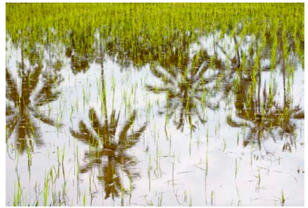
Rice and Palms