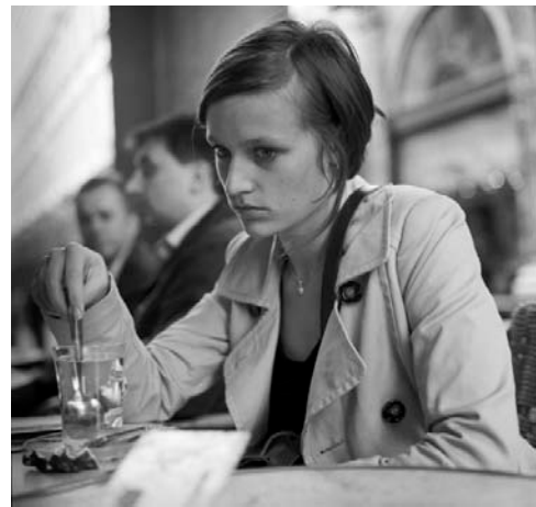
Coline 1 © Alain Cornet