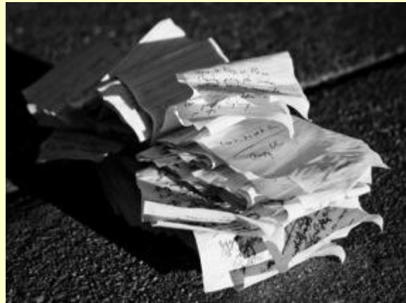
Tossed Ideas © Ceyda Oner