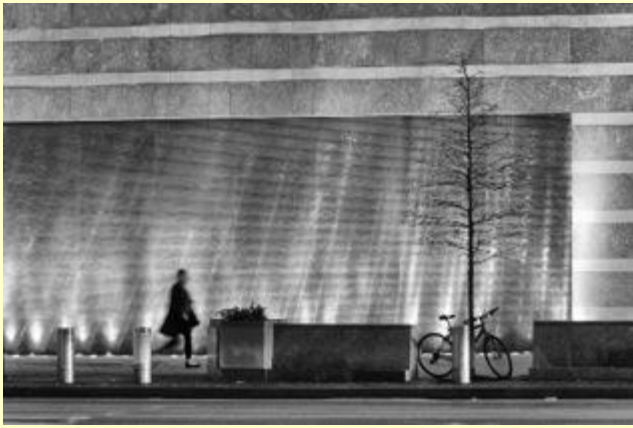
Water Wall