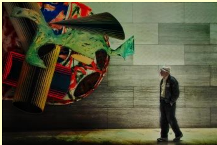
Unexpected © Jack Bujanovs