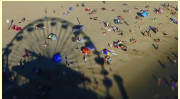
Miniature Beach