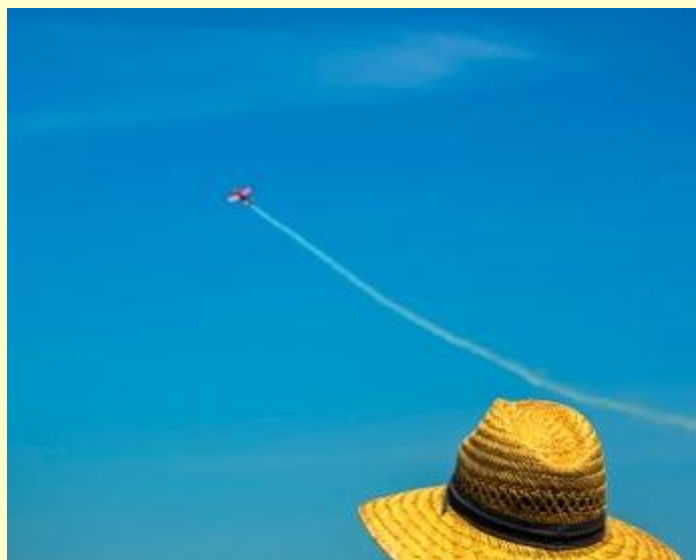
Plane Watching