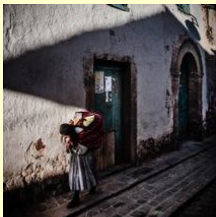
Cusco Woman