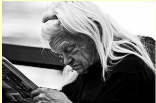
Old Lady © Gerda de Corte