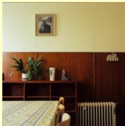
School Closing 2 © Alain Cornet