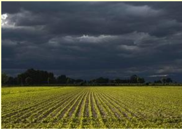
Stormy Sky