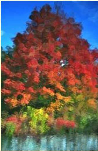
Georgetown Tree