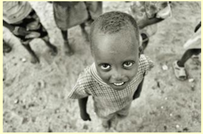
Eyes of Hope