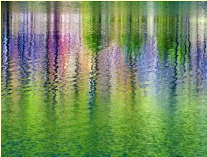
Spring Reflections