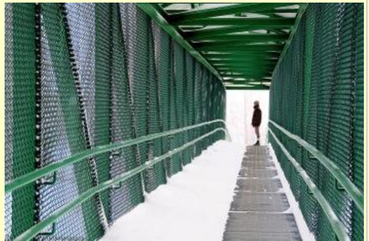
Arlington Wintergreen