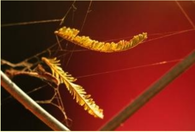
Hanging on a Thread