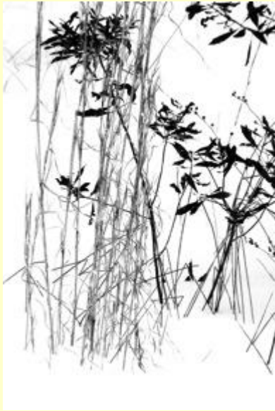
Grasses in the Snow