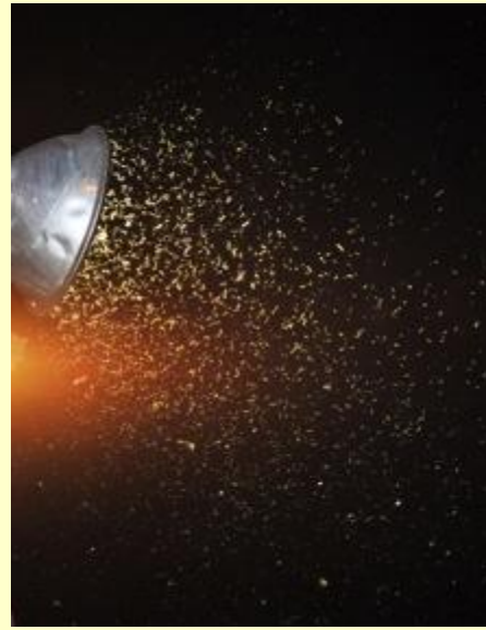
Mosquito Galore