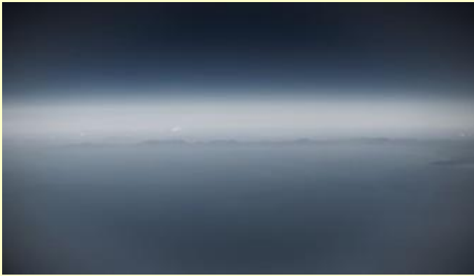
Approaching Japan