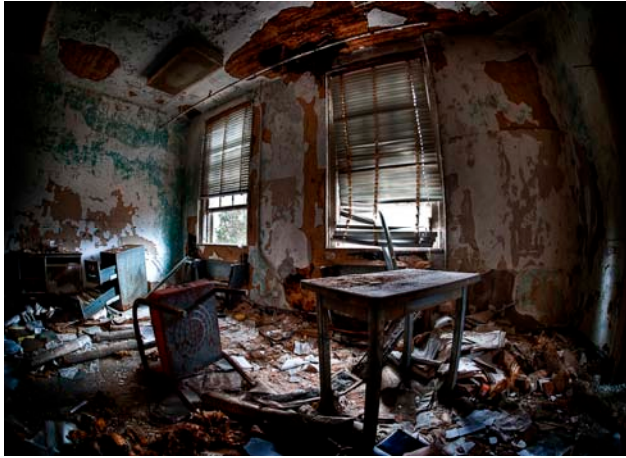
Desk and Chair, Maryland 2009