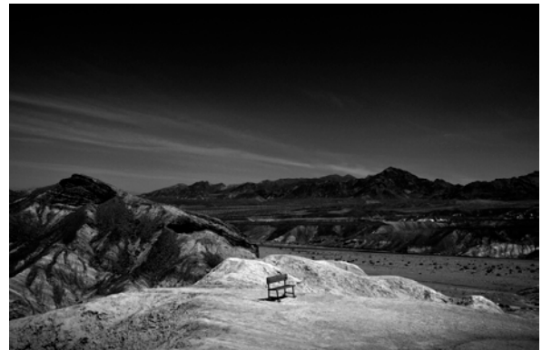
Where's the rest II © Stephan Eggli