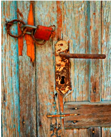
Red Lock © Emine Gurgen