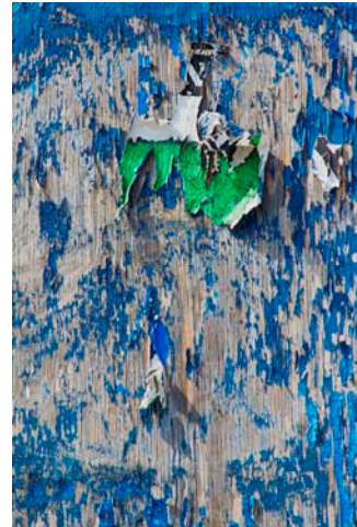
Blue Decay © Sena Eken