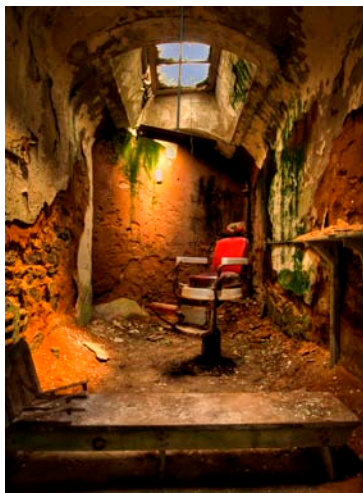
Barber Chair