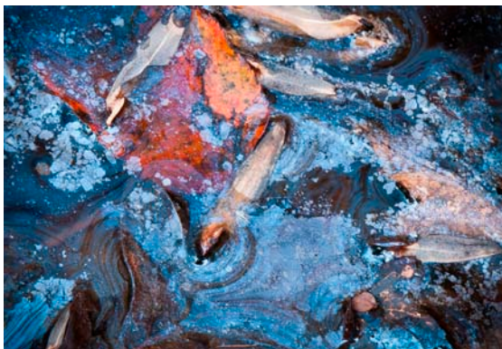
Leaf Recycling