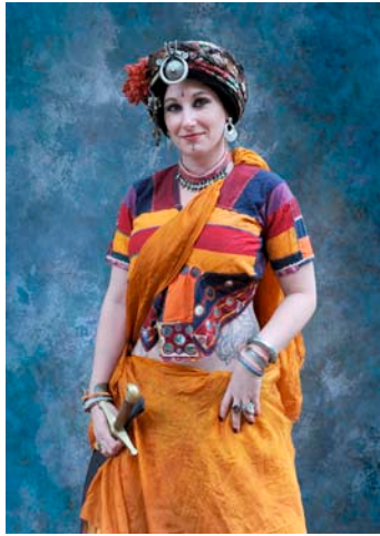
Belly Dancer