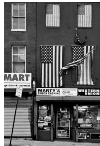
Marty's Mart