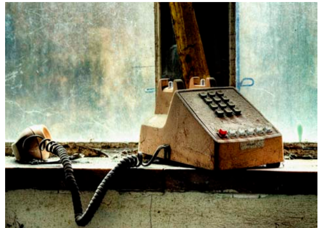
On Hold