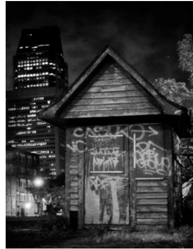
A Darker City © Raphael Titsworth-Morin