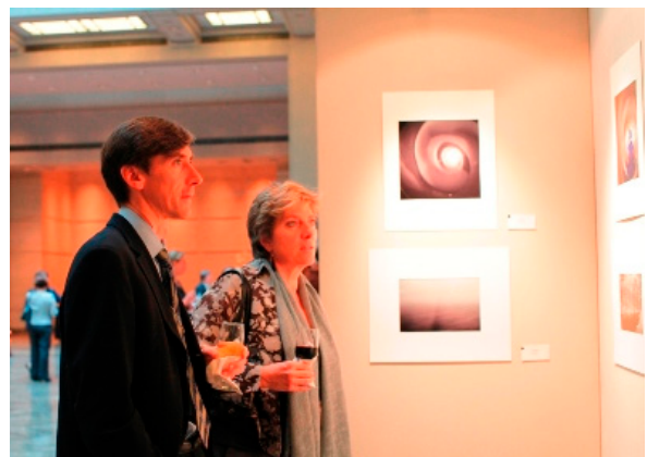
Visitors to the IPS Annual Exhibit

The IPS is one of the oldest and most popular clubs of the IMF and World Bank Group. Founded in 1966 as the IMF Camera Club, IPS has over the years offered a combination of instruction, competition, and fun.