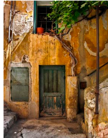
Villefranche Alley