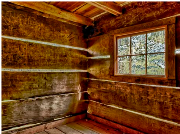
Dogwood thru window