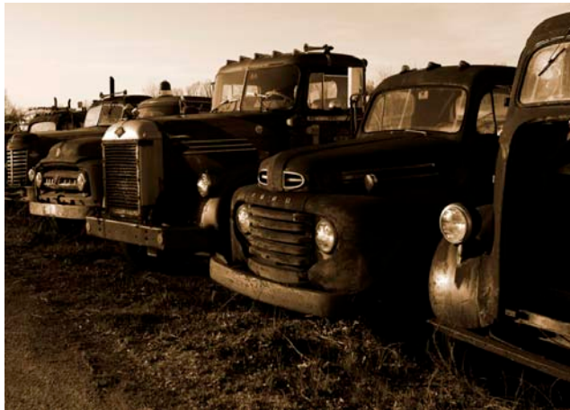
Line of Trucks