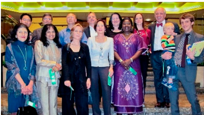
The 2011 IPS Annual Exhibit Award Winners