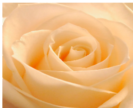
*A Rose is a Rose

*The New Member 'Special Theme' winners (Note: no points were given for this competition).