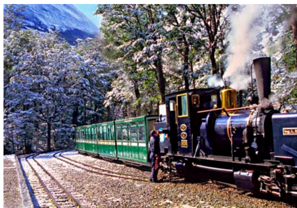
Train to the World's End ©Emine Gorgen