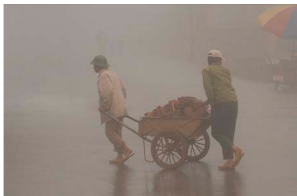
Work goes on