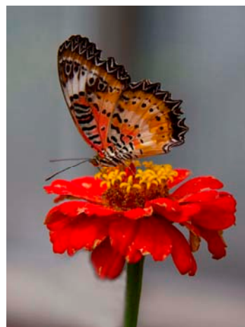
Butterfly 2 ©Sena Eken