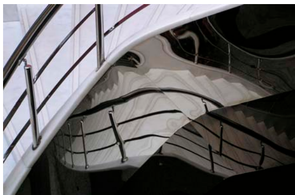
Steps Reflection