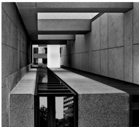
Court House Interpretation