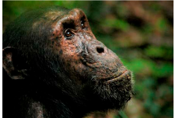
98 percent