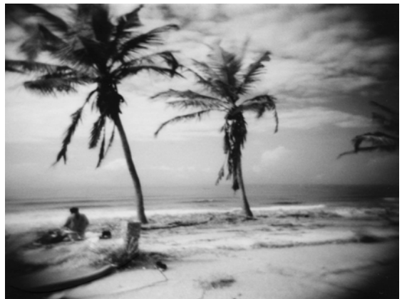
Untitled3 © Dagher