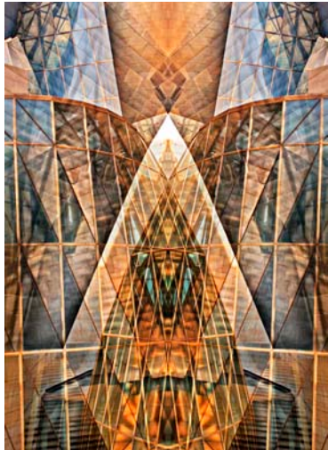
Guggenheim Interpretation