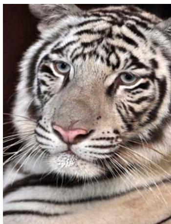
Subic Safari