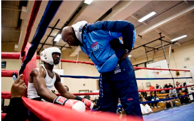
February 3 ©Dirk Mevis