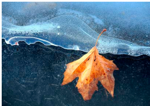
Tidal Basin Still Life