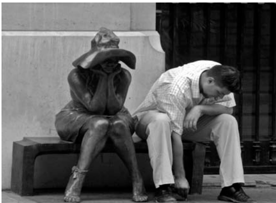
The last one ©Louise Sarr