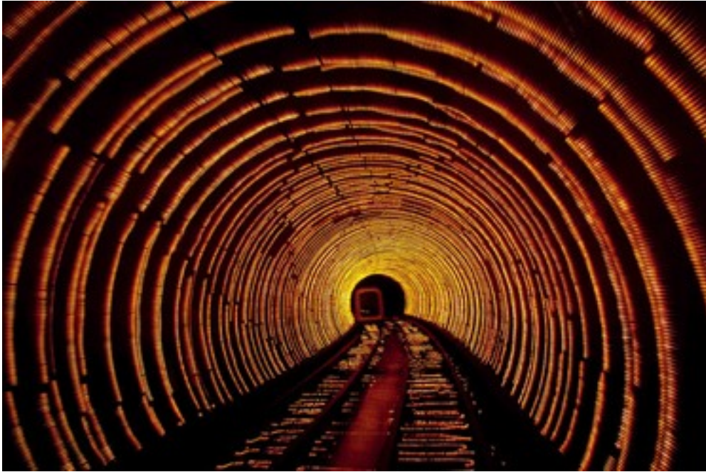
3rd Place: Ceyda Oner. Golden Tunnel