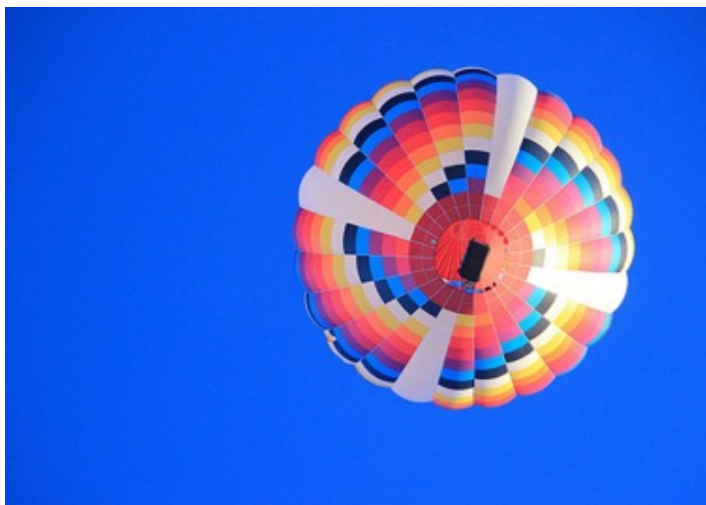
HM: Chirag Sanghani. Hot Air Balloon