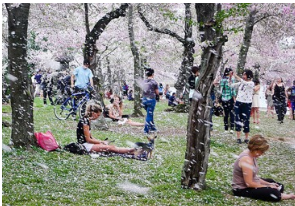
HM: Ceyda Oner. Cherry Blossom Snow