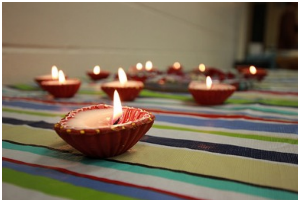
3rd place: Chirag Sanghani. Light