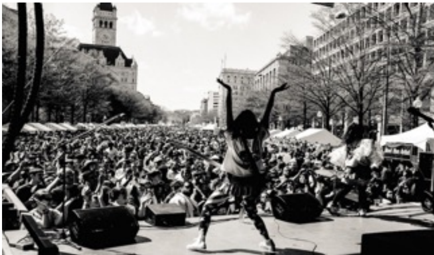
(Cherry Blossom Street Festival; Winner, Exposed DC 2016 Photo Contest , currently on exhibit at the historic Carnegie Library on Mount Vernon Square, home of DC Historical Society)

We all attend various festivals, parades and gatherings of lots of people. When I do, I seldom focus on the festival activities (unless I'm on a job to do just that) as everyone else with a camera will be taking pictures of the performers or parade. Instead, I'm much more interested in the crowds themselves and their reactions to the event. So in fact, I point my camera at the attendees and try to capture their reactions, with the "main act" as a backdrop (that was the strategy at the Cherry Blossoms Festival — where incidentally I worked for the organization that puts it together, so I got access to going backstage, which made for a shot that the hundreds of others facing the scene didn't have). Alternatively, I put myself right in the middle of the action (e.g. the pillow fight) to get a perspective of what it's like as a participant.