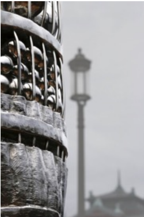
Kolbrun Kristjansdottir, Steel 3 rd Place