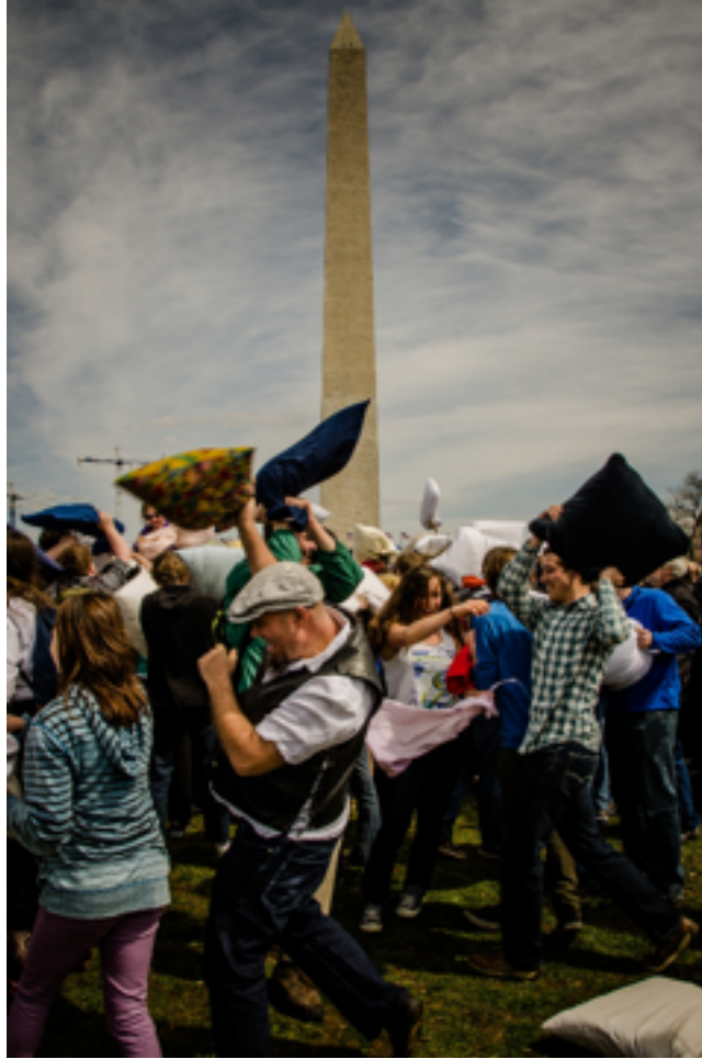
(Left: Anime at Sakura Street Festival ; Above: Pillow Fight . Copyright Michele Egan)