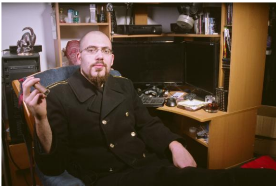
An Artist of Sorts © Raphael Titsworth-Morin