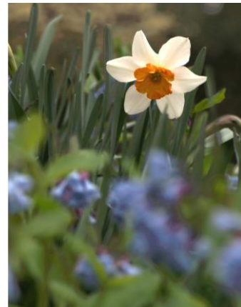
McCrillis Daffodil