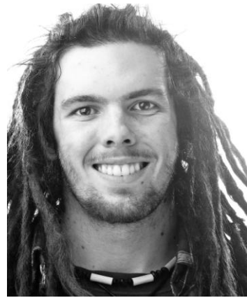
Self Portrait