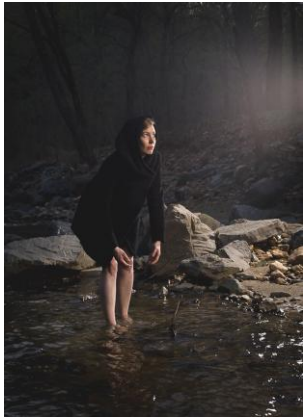
Black Cap