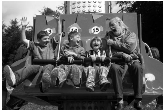
O. M. G.