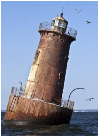
Sharps Island Lighthouse