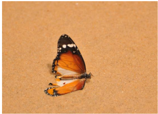
End of Trip