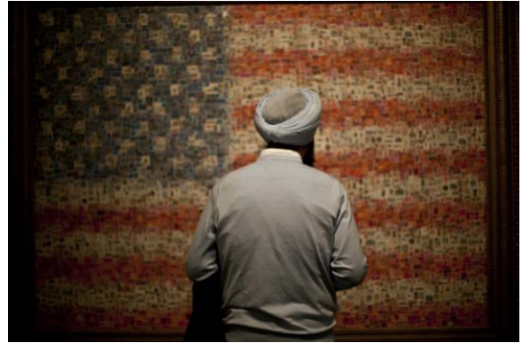
Stars, Stripes and a Turban © Gerda de Corte