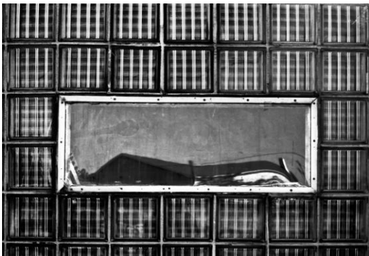
Glass Wall © Alex Hoffmaister