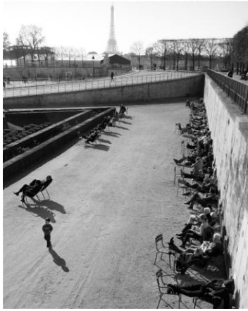
Paris Spring