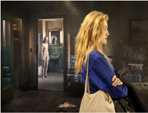
Women Issues © Gerda de Corte