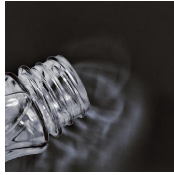
Pom Bottle