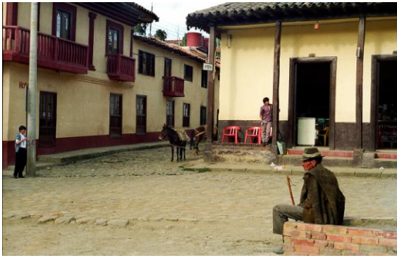
Villa de Leyva Main Square © Carmen Machicado