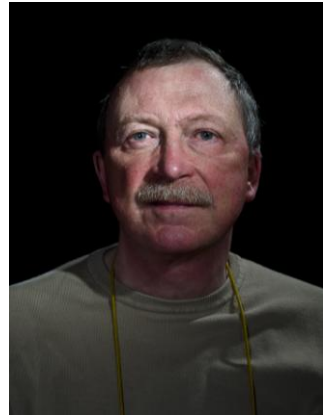
Louis © Dirk Mevis