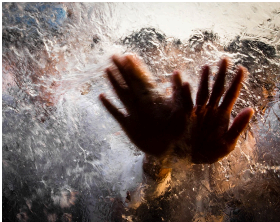
HM: Shannon Turkewitz. Thingyan