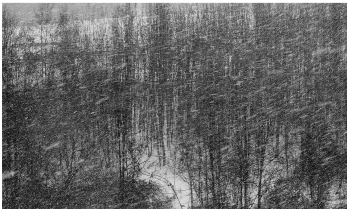
2nd Place: Chirag Sanghani. Snow Art I