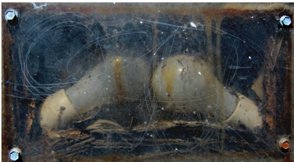
1st Place: Chirag Sanghani. Lights Out