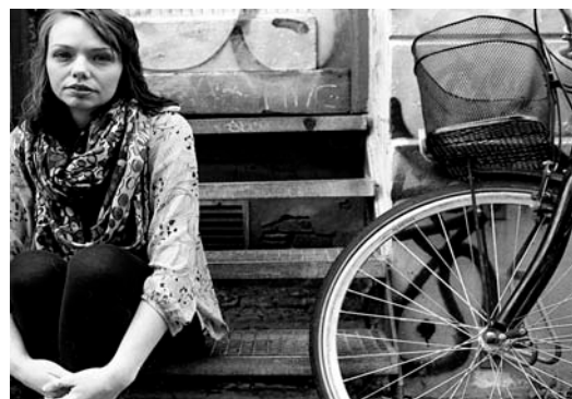
And Copenhagen too