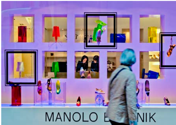
Manolo B window