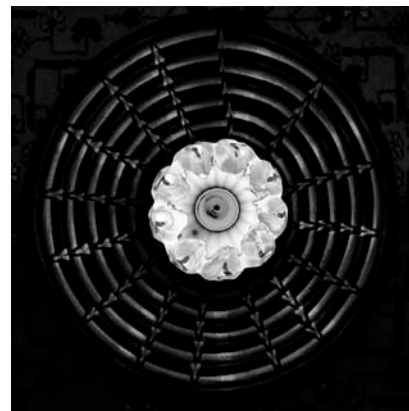
Candle Interpretation 2