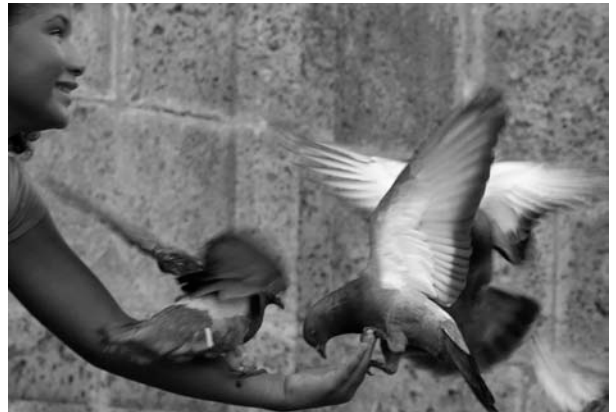
Help Yourself © Alex Ergo