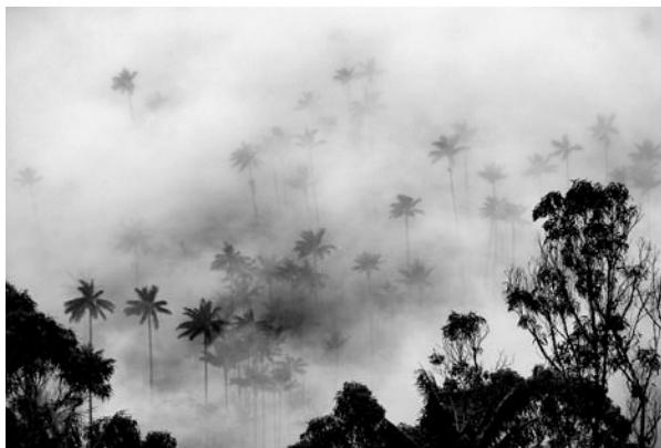
Villa de Cocora 2