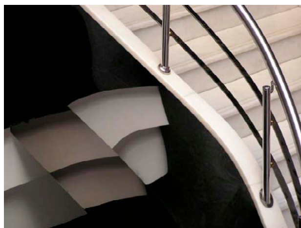
Unusual Steps Reflection