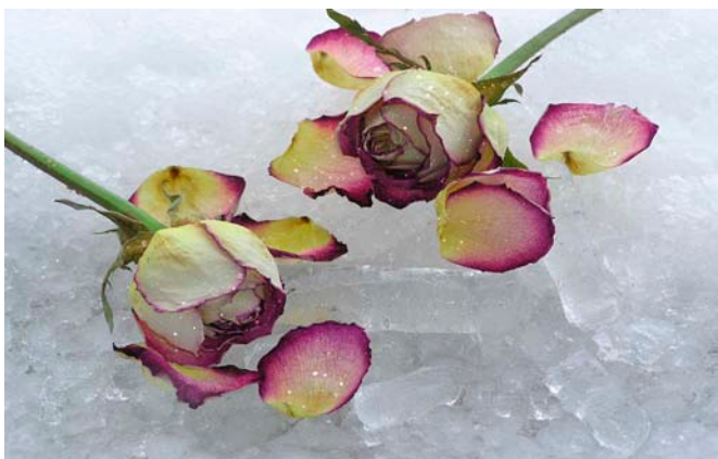
Long Wait