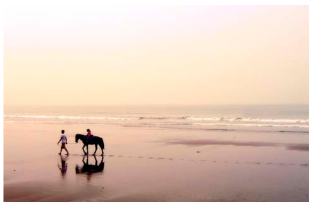
Scene from Kribi Beach, Cameroon