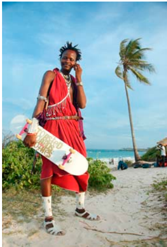
Maasai