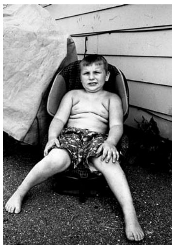
The Littlefields #5