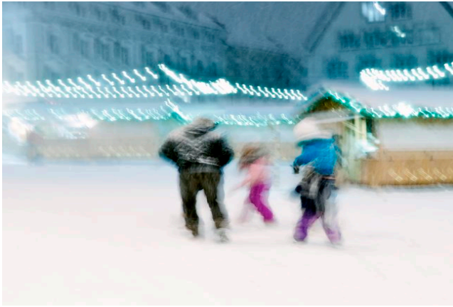
Walking in the square