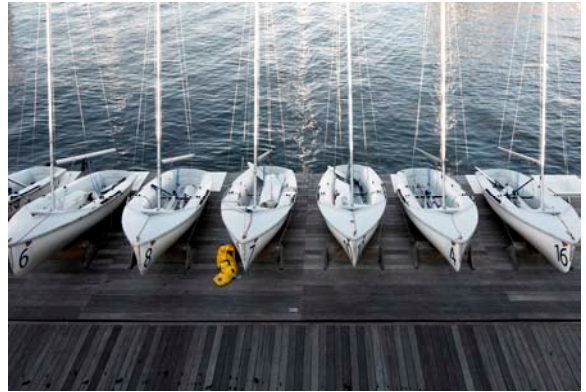
Seven © Suzanne Pelland