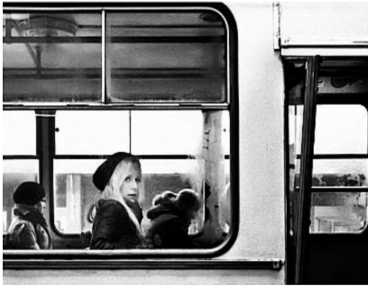
Riding 422