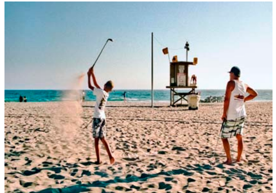
Four More Swings © Alex Hoffmaister