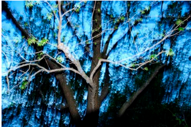
Sweetgum Spring Streaks © Fred Cochard