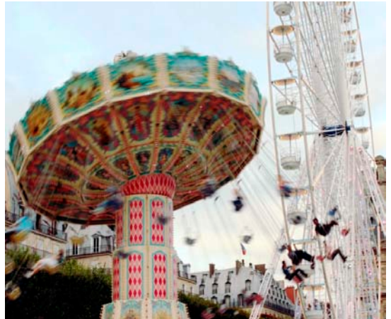
Carousel in Paris