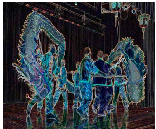
Dragon Dance