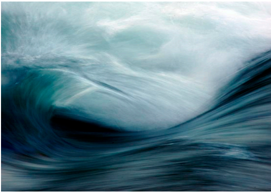
Blue Vortex © Pritthijit (Raja) Kundu