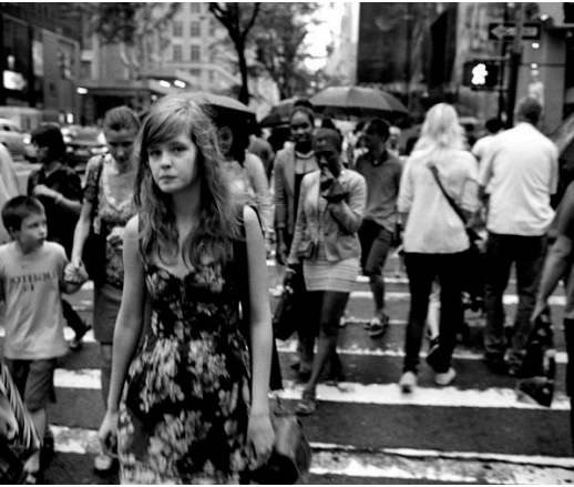
Untitled3 © Jihad Dagher