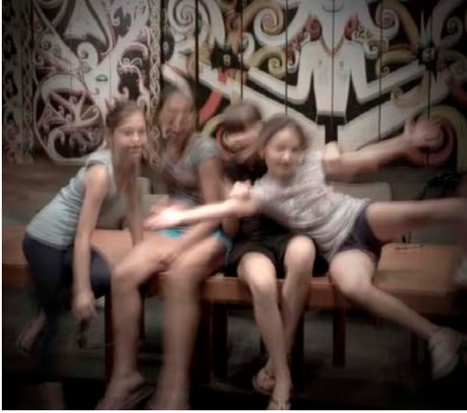
Friendzy