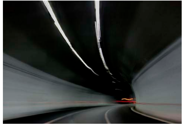
Route A8