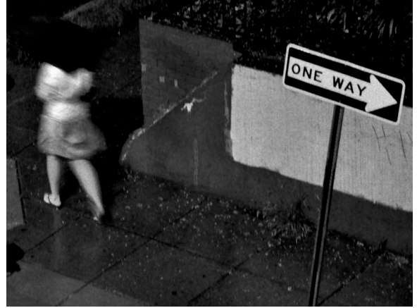
Wrong way © Stephan Eggli