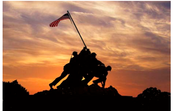
Iwojima Memorial