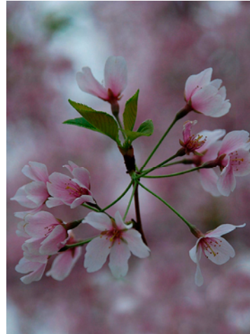
Cherry Blossom