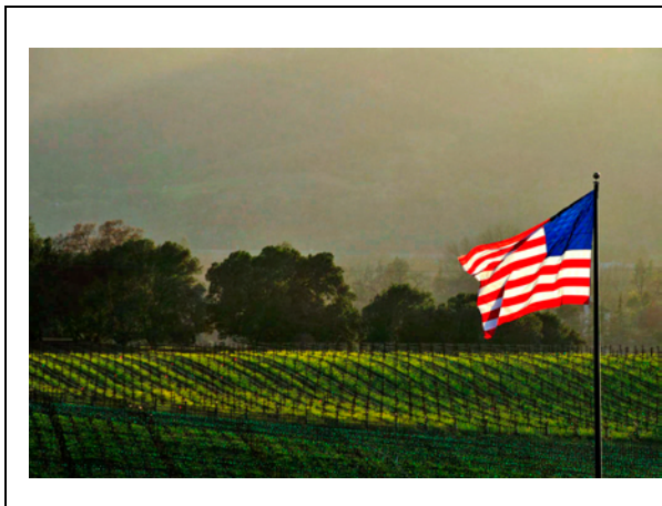
Napa Vineyard and Flag