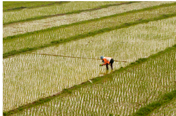
Big Job