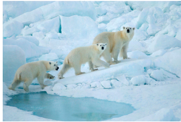
Endangered Species ©Marketa Jirouskova