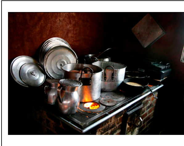
Breakfast Cooking