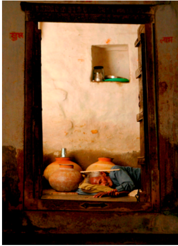
Silent Afternoon