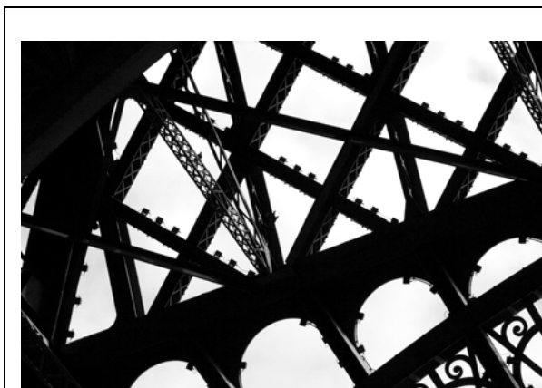
Les temps modernes